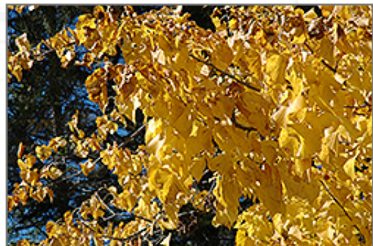
Redmond Linden in fall