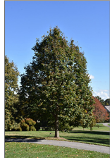
Redmond Linden

This is a relatively low maintenance tree, and is best pruned in late winter once the threat of extreme cold has passed. It is a good choice for attracting bees to your yard. Gardeners should be aware of the following characteristic(s) that may warrant special consideration;