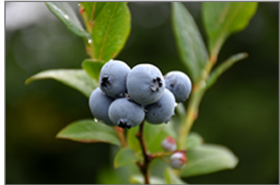
Northsky Blueberry fruit