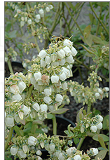
Blueray Blueberry flowers