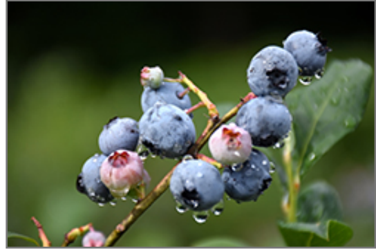
Blueray Blueberry fruit