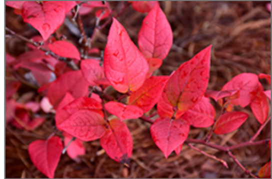
Northland Blueberry in fall

This shrub does best in full sun to partial shade. It does best in average to evenly moist conditions, but will not tolerate standing water. It is very fussy about its soil conditions and must have sandy, acidic soils to ensure success, and is subject to chlorosis (yellowing) of the foliage in alkaline soils. It is quite intolerant of urban pollution, therefore inner city or urban streetside plantings are best avoided, and will benefit from being planted in a relatively sheltered location. Consider applying a thick mulch around the root zone in winter to protect it in exposed locations or colder microclimates. This is a selection of a native North American species.