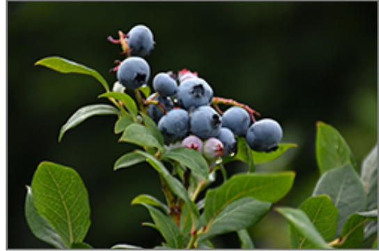
Northland Blueberry fruit