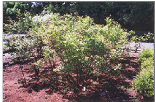
Northland Blueberry