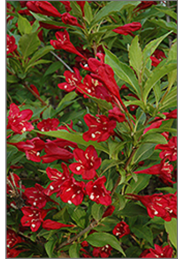
Red Prince Weigela flowers

Red Prince Weigela is recommended for the following landscape applications;