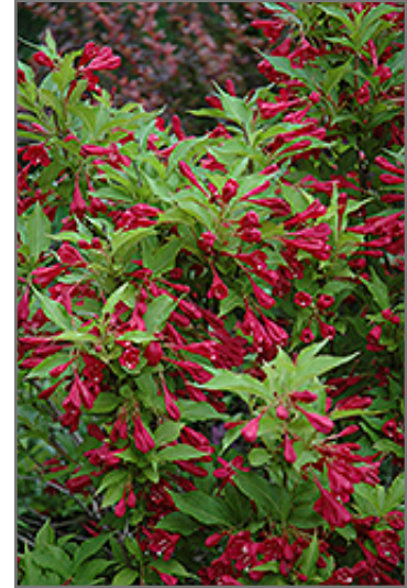
Red Prince Weigela flowers

This shrub should only be grown in full sunlight. It prefers to grow in average to moist conditions, and shouldn't be allowed to dry out. It is not particular as to soil type or pH. It is highly tolerant of urban pollution and will even thrive in inner city environments. This is a selected variety of a species not originally from North America.