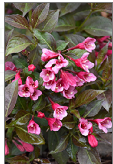
Tango Weigela flowers