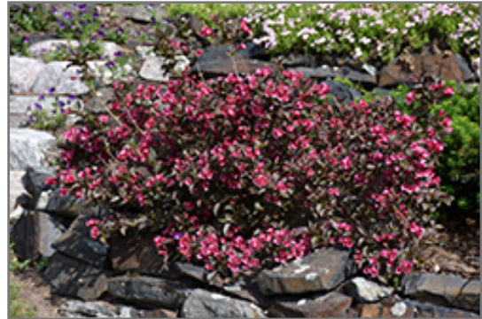
Tango Weigela in bloom

This shrub will require occasional maintenance and upkeep, and should only be pruned after flowering to avoid removing any of the current season's flowers. It is a good choice for attracting hummingbirds to your yard. It has no significant negative characteristics.