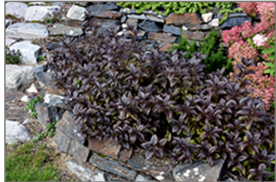
Tango Weigela

Tango Weigela will grow to be about 24 inches tall at maturity, with a spread of 3 feet. It tends to fill out right to the ground and therefore doesn't necessarily require facer plants in front. It grows at a medium rate, and under ideal conditions can be expected to live for approximately 30 years.