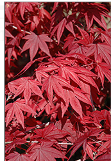
Emperor I Japanese Maple foliage