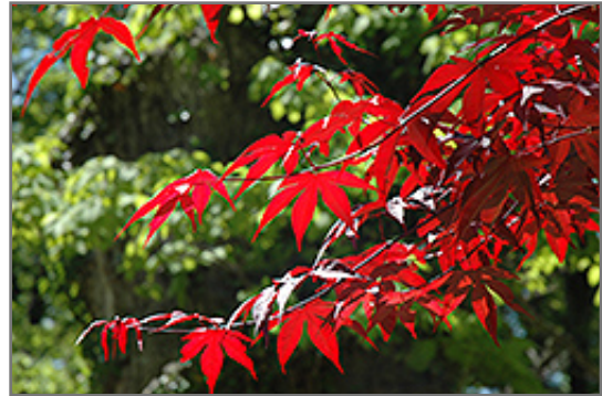
Emperor I Japanese Maple foliage

This tree does best in full sun to partial shade. You may want to keep it away from hot, dry locations that receive direct afternoon sun or which get reflected sunlight, such as against the south side of a white wall. It prefers to grow in average to moist conditions, and shouldn't be allowed to dry out. It is not particular as to soil pH, but grows best in rich soils. It is somewhat tolerant of urban pollution, and will benefit from being planted in a relatively sheltered location. Consider applying a thick mulch around the root zone in winter to protect it in exposed locations or colder microclimates. This is a selected variety of a species not originally from North America.