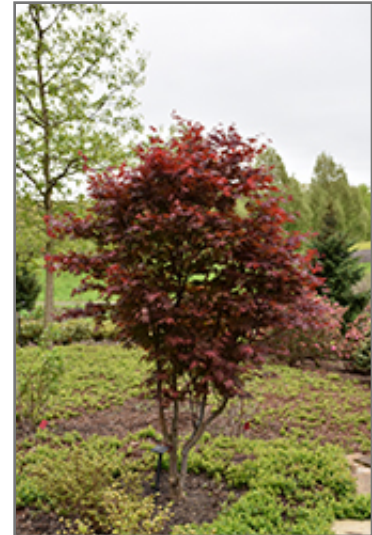
Emperor I Japanese Maple

Emperor I Japanese Maple is recommended for the following landscape applications;