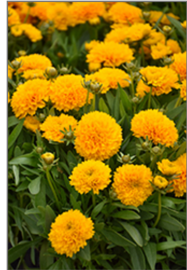
Solanna Golden Sphere Tickseed flowers

This plant should only be grown in full sunlight. It does best in average to evenly moist conditions, but will not tolerate standing water. It is not particular as to soil pH, but grows best in poor soils. It is somewhat tolerant of urban pollution. This is a selection of a native North American species. It can be propagated by division; however, as a cultivated variety, be aware that it may be subject to certain restrictions or prohibitions on propagation.