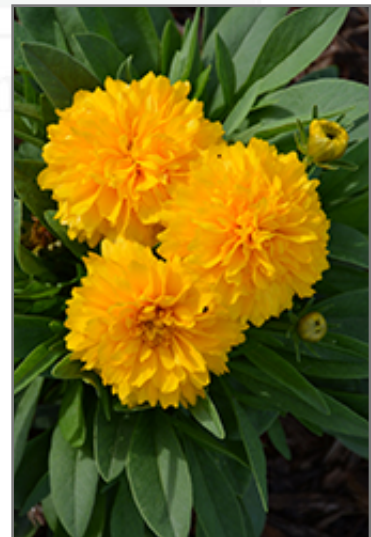
Solanna Golden Sphere Tickseed flowers