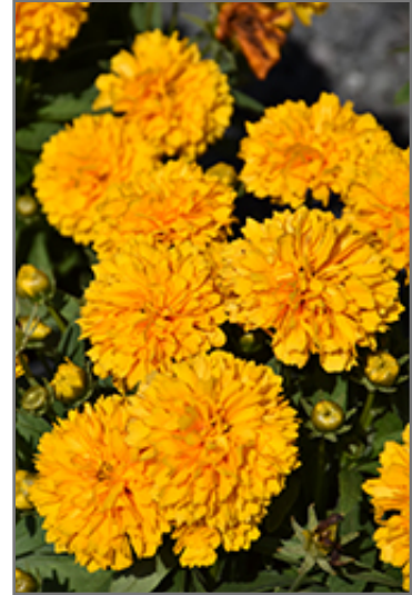
Solanna Golden Sphere Tickseed flowers

Solanna Golden Sphere Tickseed is recommended for the following landscape applications;