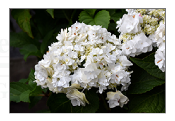
Wedding Gown Hydrangea flowers

This shrub will require occasional maintenance and upkeep, and should only be pruned after flowering to avoid removing any of the current season's flowers. It has no significant negative characteristics.