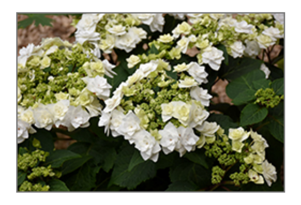
Wedding Gown Hydrangea flowers

Wedding Gown Hydrangea is a multi-stemmed deciduous shrub with a mounded form. Its relatively coarse texture can be used to stand it apart from other landscape plants with finer foliage.