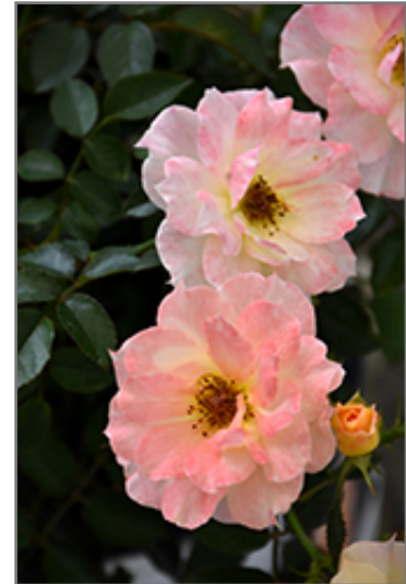
Oso Easy Italian Ice Rose flowers

Oso Easy Italian Ice Rose is recommended for the following landscape applications;