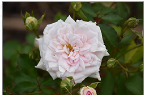
White Drift Rose flowers