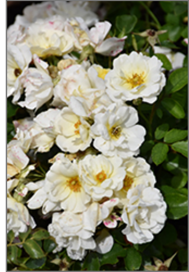
White Drift Rose flowers

This shrub will require occasional maintenance and upkeep, and is best pruned in late winter once the threat of extreme cold has passed. It is a good choice for attracting bees to your yard. It has no significant negative characteristics.