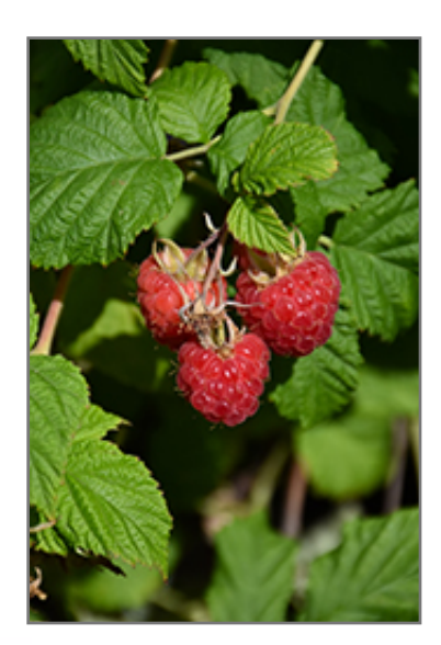
Raspberry Shortcake Raspberry fruit

Raspberry Shortcake Raspberry has rich green deciduous foliage on a plant with an upright spreading habit of growth. The textured oval compound leaves do not develop any appreciable fall colour. It features an abundance of magnificent red berries in mid summer.