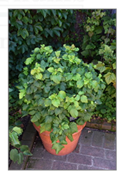
Raspberry Shortcake Raspberry