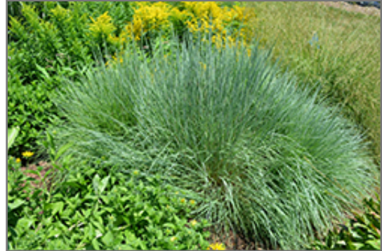
Prairie Blues Bluestem

Prairie Blues Bluestem is recommended for the following landscape applications;