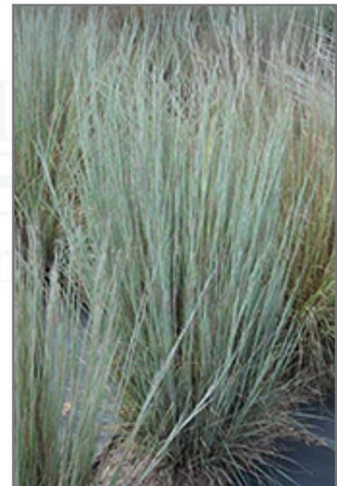
Prairie Blues Bluestem