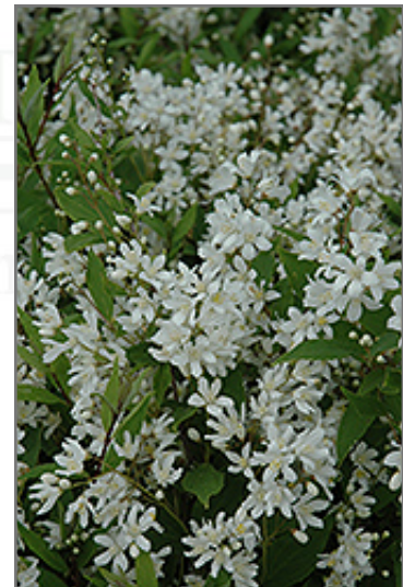
Nikko Deutzia flowers