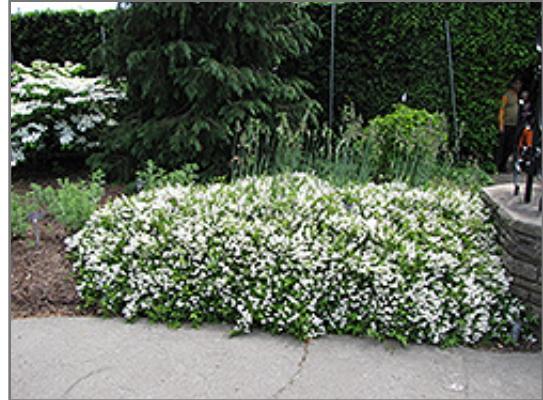
Nikko Deutzia in bloom

Nikko Deutzia is recommended for the following landscape applications;