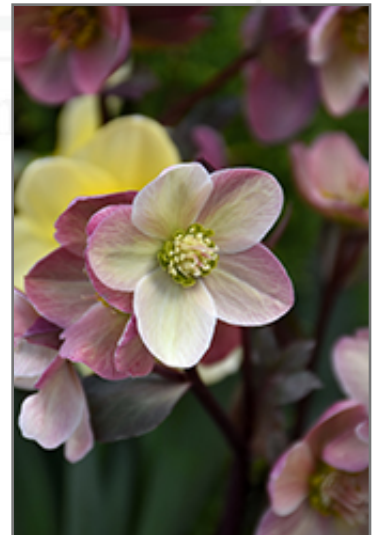
Pink Frost Hellebore flowers