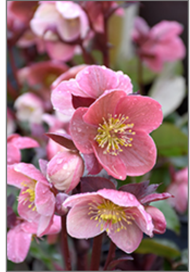
Pink Frost Hellebore flowers

This is a relatively low maintenance plant, and should be cut back in late fall in preparation for winter. Deer don't particularly care for this plant and will usually leave it alone in favor of tastier treats. It has no significant negative characteristics.