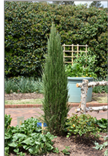
Blue Arrow Juniper