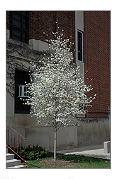
Spring Flurry Serviceberry in bloom

Spring Flurry Serviceberry is recommended for the following landscape applications;