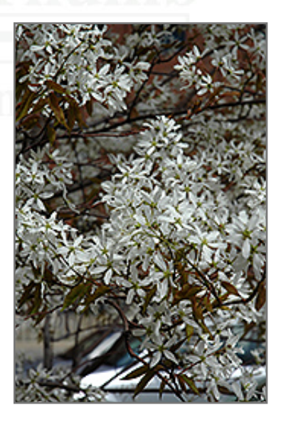
Spring Flurry Serviceberry flowers