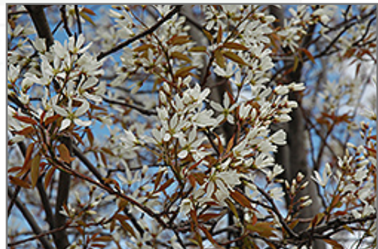
Autumn Brilliance Serviceberry flowers