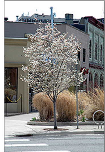
Autumn Brilliance Serviceberry in bloom

This is a relatively low maintenance tree, and is best pruned in late winter once the threat of extreme cold has passed. It is a good choice for attracting birds to your yard, but is not particularly attractive to deer who tend to leave it alone in favor of tastier treats. It has no significant negative characteristics.