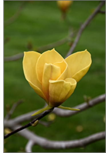
Judy Zuk Magnolia flowers