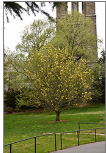
Judy Zuk Magnolia in bloom