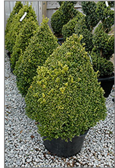
Green Mountain Boxwood (pyramid form)