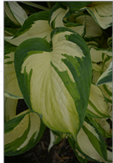
Vulcan Hosta foliage