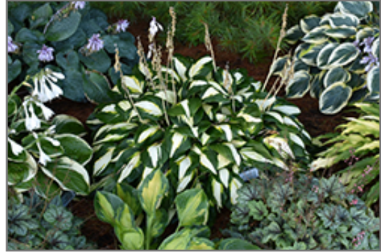
Vulcan Hosta

Vulcan Hosta is a dense herbaceous perennial with tall flower stalks held atop a low mound of foliage. Its relatively fine texture sets it apart from other garden plants with less refined foliage.