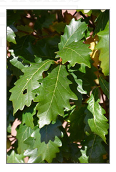
Kindred Spirit Oak foliage