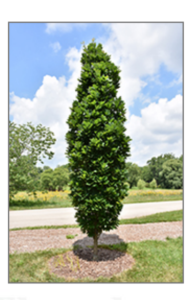
Kindred Spirit Oak