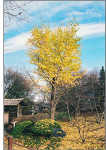
Ginkgo in fall

This tree should only be grown in full sunlight. It is very adaptable to both dry and moist locations, and should do just fine under average home landscape conditions. It is not particular as to soil type or pH, and is able to handle environmental salt. It is highly tolerant of urban pollution and will even thrive in inner city environments. Consider applying a thick mulch around the root zone in winter to protect it in exposed locations or colder microclimates. This species is not originally from North America.