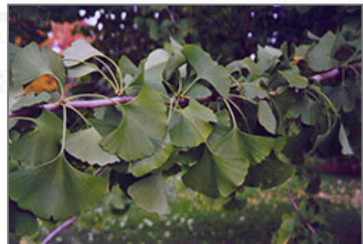
Ginkgo foliage