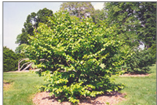
Common Witchhazel