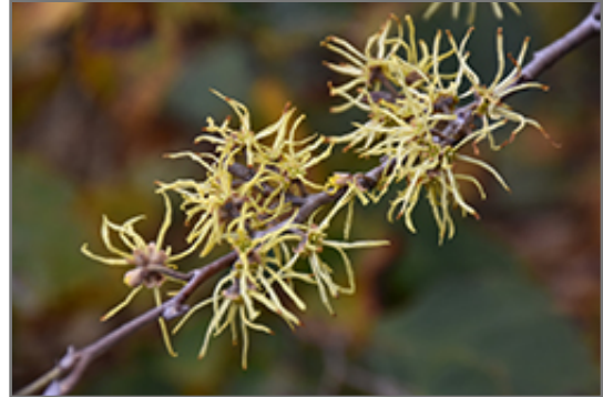
Common Witchhazel flowers

Common Witchhazel is recommended for the following landscape applications;