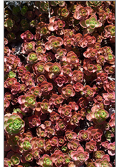
Dragon's Blood Stonecrop in fall

Dragon's Blood Stonecrop is a dense herbaceous perennial with a ground-hugging habit of growth. It brings an extremely fine and delicate texture to the garden composition and should be used to full effect.