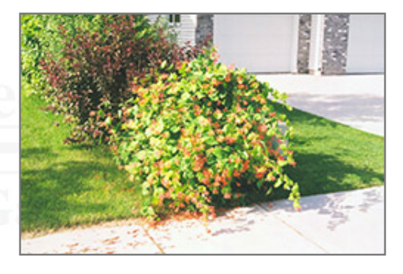
Mandarin Trumpet Honeysuckle in bloom

Mandarin Trumpet Honeysuckle is a multi-stemmed deciduous woody vine with a twining and trailing habit of growth. Its relatively coarse texture can be used to stand it apart from other landscape plants with finer foliage.