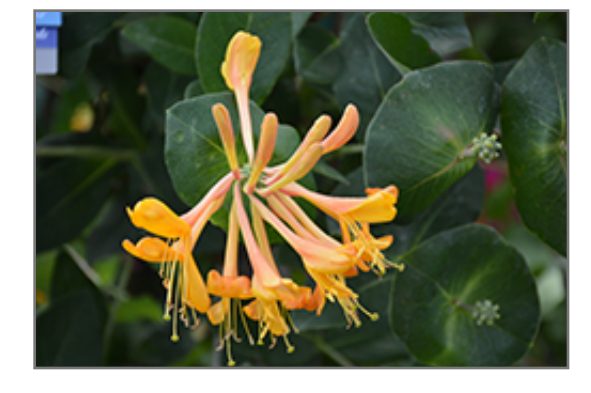
Mandarin Trumpet Honeysuckle flowers