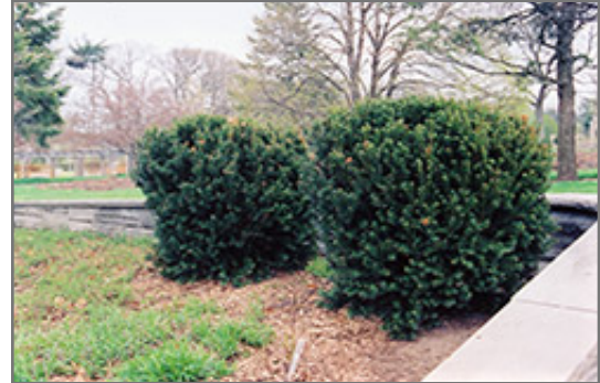
Hill's Yew