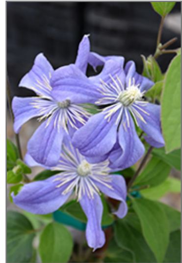
Arabella Clematis flowers