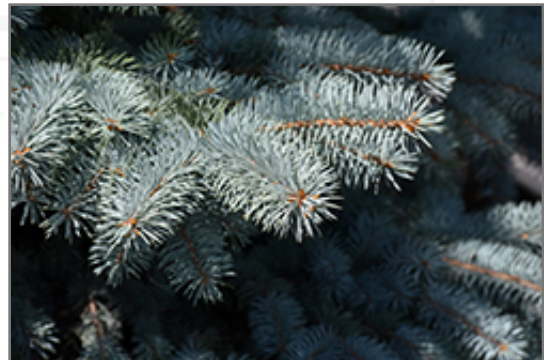
Baby Blue Blue Spruce foliage