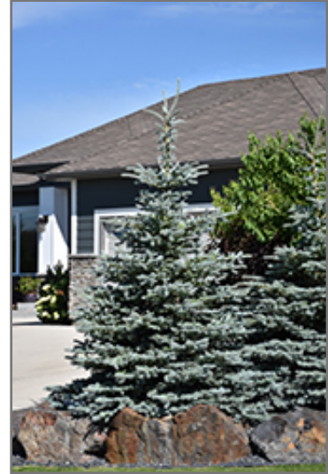
Baby Blue Blue Spruce

Baby Blue Blue Spruce is a dense evergreen tree with a strong central leader and a distinctive and refined pyramidal form. Its average texture blends into the landscape, but can be balanced by one or two finer or coarser trees or shrubs for an effective composition.