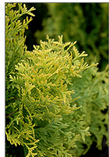
Amber Gold Arborvitae foliage