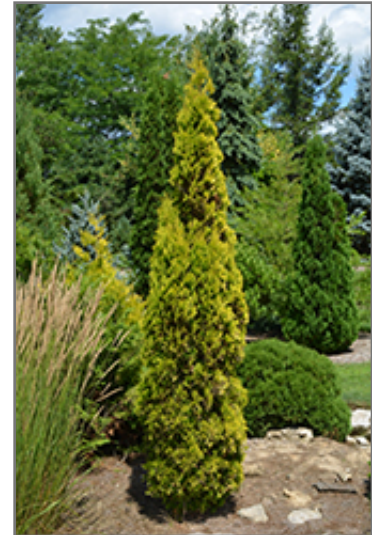
Amber Gold Arborvitae

Amber Gold Arborvitae is recommended for the following landscape applications;