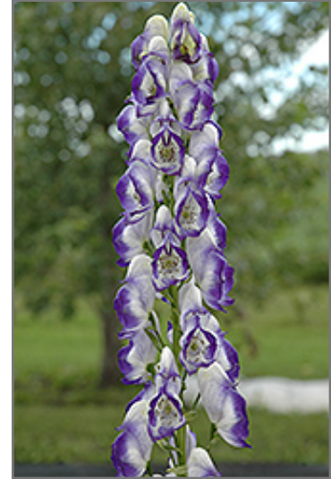
Bicolor Monkshood flowers