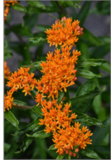
Butterfly Weed flowers

Butterfly Weed is recommended for the following landscape applications;