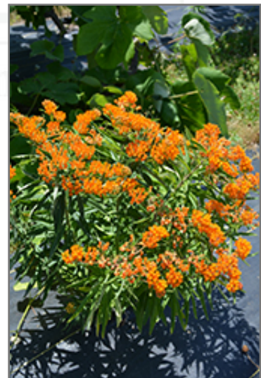
Butterfly Weed in bloom