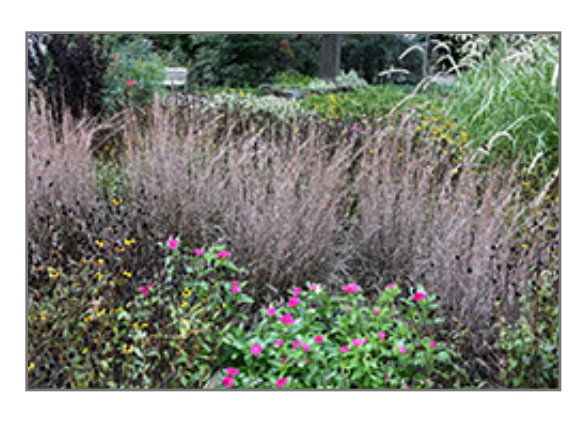
Standing Ovation Bluestem in fall

This is a relatively low maintenance plant, and is best cut back to the ground in late winter before active growth resumes. It has no significant negative characteristics.