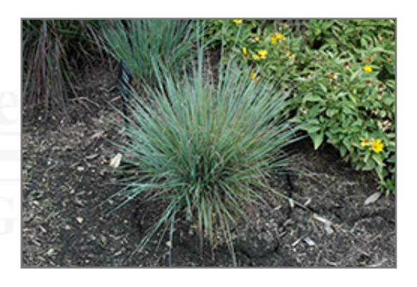
Standing Ovation Bluestem