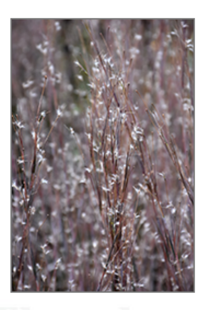
Standing Ovation Bluestem fruit

This plant should only be grown in full sunlight. It is very adaptable to both dry and moist locations, and should do just fine under typical garden conditions. It is considered to be drought-tolerant, and thus makes an ideal choice for a low-water garden or xeriscape application. It is not particular as to soil type or pH. It is somewhat tolerant of urban pollution. This is a selection of a native North American species. It can be propagated by division; however, as a cultivated variety, be aware that it may be subject to certain restrictions or prohibitions on propagation.