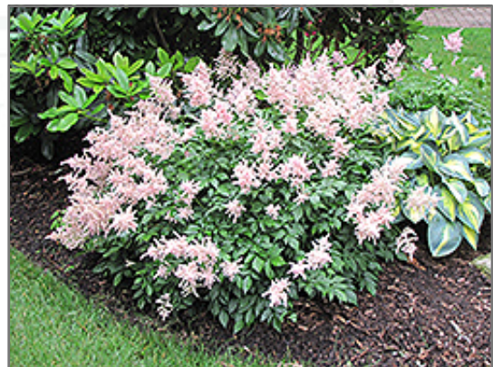
Peach Blossom Astilbe in bloom