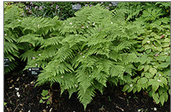
Lady Fern