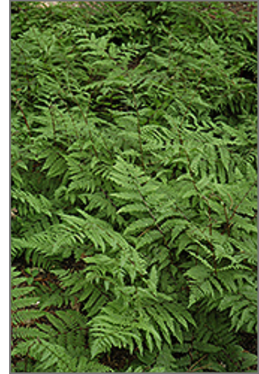
Lady Fern foliage

Lady Fern is recommended for the following landscape applications;