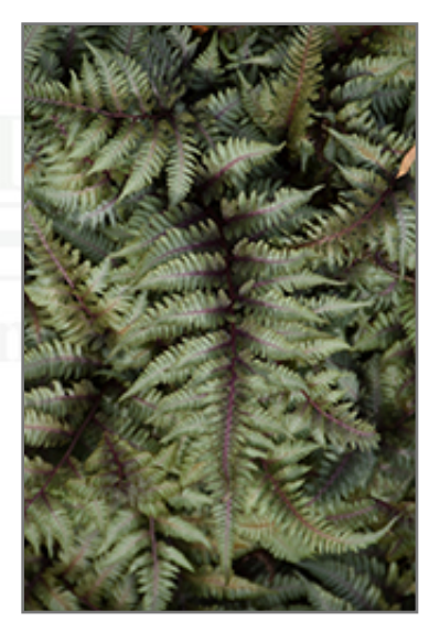
Japanese Painted Fern foliage