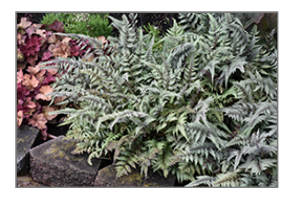
Japanese Painted Fern

Japanese Painted Fern is a dense herbaceous perennial with a shapely form and gracefully arching foliage. It brings an extremely fine and delicate texture to the garden composition and should be used to full effect.