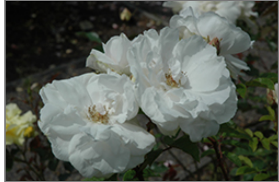
Sir Thomas Lipton Rose flowers