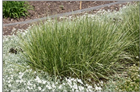
Variegated Reed Grass