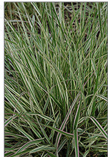
Variegated Reed Grass foliage