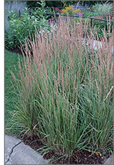
Variegated Reed Grass in bloom

Variegated Reed Grass is an herbaceous perennial with an upright spreading habit of growth. It brings an extremely fine and delicate texture to the garden composition and should be used to full effect.