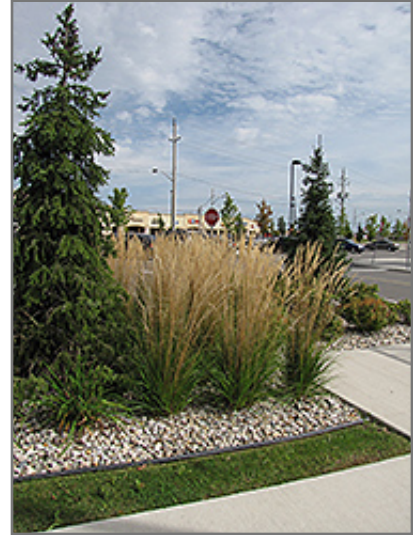
Karl Foerster Reed Grass in bloom

Karl Foerster Reed Grass is a fine choice for the garden, but it is also a good selection for planting in outdoor pots and containers. With its upright habit of growth, it is best suited for use as a 'thriller' in the 'spiller-thriller-filler' container combination; plant it near the center of the pot, surrounded by smaller plants and those that spill over the edges. It is even sizeable enough that it can be grown alone in a suitable container. Note that when growing plants in outdoor containers and baskets, they may require more frequent waterings than they would in the yard or garden. Be aware that in our climate, most plants cannot be expected to survive the winter if left in containers outdoors, and this plant is no exception. Contact our experts for more information on how to protect it over the winter months.