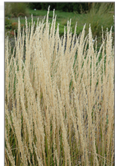
Karl Foerster Reed Grass flowers