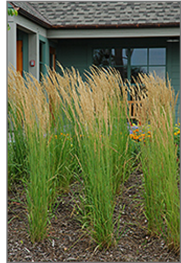
Karl Foerster Reed Grass

Karl Foerster Reed Grass is recommended for the following landscape applications;