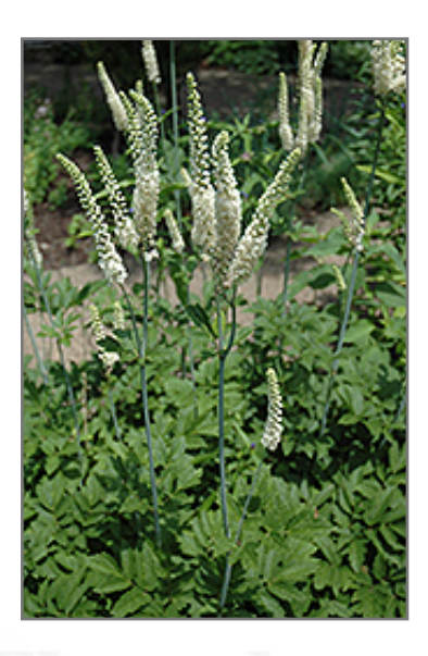
American Bugbane in bloom

From shaded areas to full sun, fragrant white, bottle brush flowers rise high above lacy, green foliage; blooming mid to late summer, great for mixed containers, garden beds or fresh-cut arrangements; easy to grow and can be cut back in fall