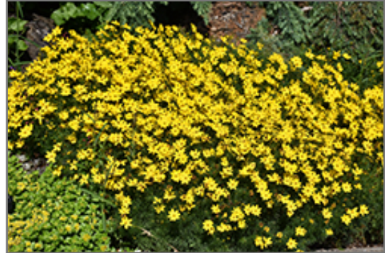
Zagreb Tickseed in bloom

Zagreb Tickseed is recommended for the following landscape applications;