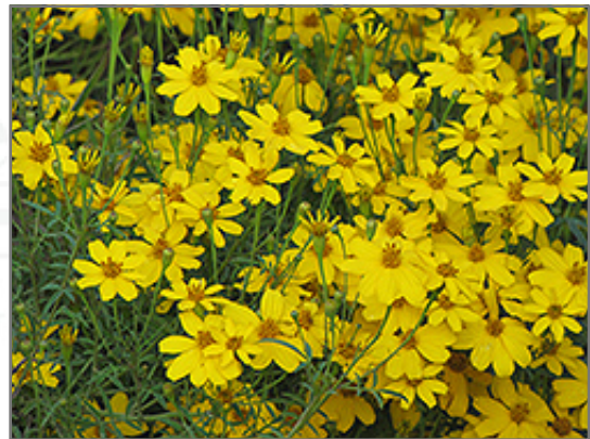
Zagreb Tickseed flowers