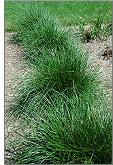
Tufted Hair Grass