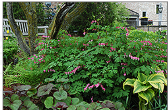
Common Bleeding Heart in bloom