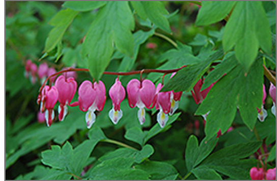
Common Bleeding Heart flowers

Common Bleeding Heart is recommended for the following landscape applications;