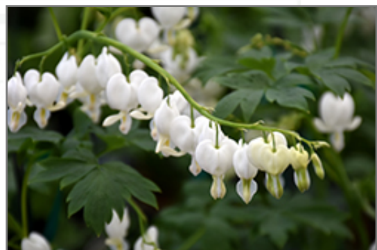
White Bleeding Heart flowers