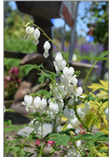
White Bleeding Heart flowers

White Bleeding Heart is recommended for the following landscape applications;