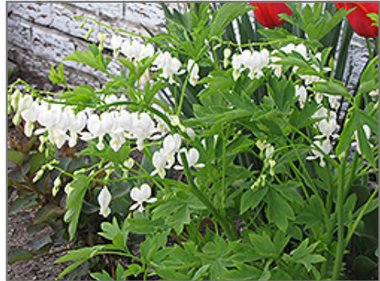
White Bleeding Heart in bloom

White Bleeding Heart will grow to be about 32 inches tall at maturity, with a spread of 3 feet. When grown in masses or used as a bedding plant, individual plants should be spaced approximately 30 inches apart. It grows at a medium rate, and under ideal conditions can be expected to live for approximately 15 years. As an herbaceous perennial, this plant will usually die back to the crown each winter, and will regrow from the base each spring. Be careful not to disturb the crown in late winter when it may not be readily seen! As this plant tends to go dormant in summer, it is best interplanted with late-season bloomers to hide the dying foliage.