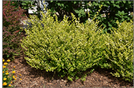
Cesky Gold Dwarf Birch

Cesky Gold Dwarf Birch is recommended for the following landscape applications;