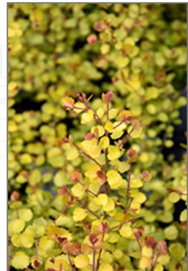
Cesky Gold Dwarf Birch foliage