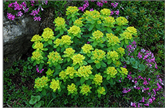
Cushion Spurge in bloom

Cushion Spurge is recommended for the following landscape applications;