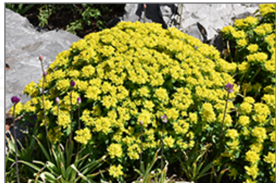
Cushion Spurge in bloom