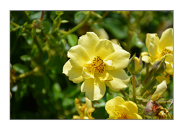
Oso Easy Lemon Zest Rose flowers

An amazing rose, blooming all season with abundant bright yellow flowers; a low mounding habit makes it perfect for the garden, along walks, or as an informal hedge; all roses need full sun and well-drained soil