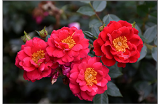
Oso Easy Urban Legend Rose flowers

Oso Easy Urban Legend Rose is recommended for the following landscape applications;