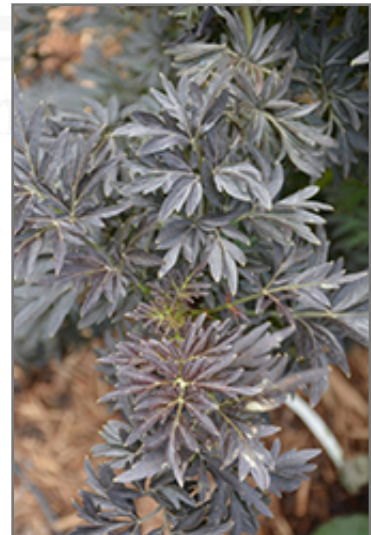
Laced Up Elder foliage