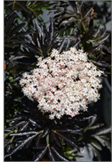
Laced Up Elder flowers