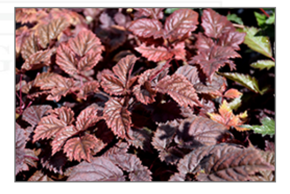
Chocolate Shogun Astilbe foliage