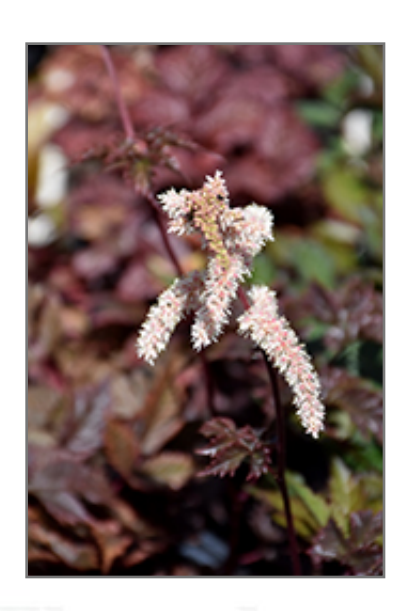
Chocolate Shogun Astilbe flowers

Chocolate Shogun Astilbe is an herbaceous perennial with an upright spreading habit of growth. Its relatively fine texture sets it apart from other garden plants with less refined foliage.